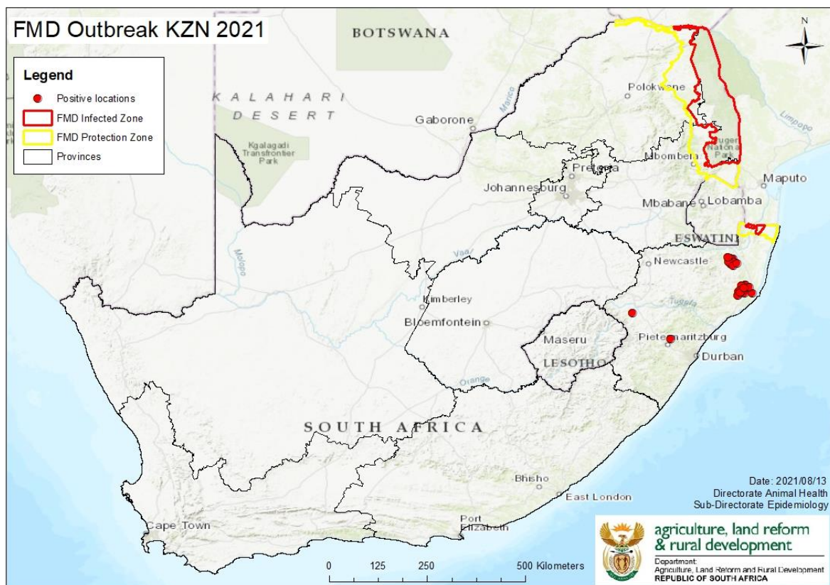
Map 1: FMD positive locations in KwaZulu-Natal, South Africa

In May 2021, an outbreak of Foot and Mouth Disease (FMD) in cattle was confirmed in the Umkhanyakude District Municipality of the KwaZulu-Natal Province. Twenty-six locations in KwaZulu-Natal Province have been identified as FMD positive and reported to the OIE. Disease investigations to determine the extent of the spread of disease are nearing completion. The following map shows positive locations. Note that locations with close proximity may appear as a single location on this map.